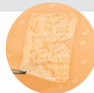
Tissue pictures are representative. Pattern may vary slightly.

Cover with appropriate wound dressings. For more details, please refer to the Instructions For Use.