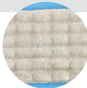
Larger pattern side faces DOWN