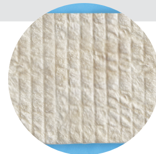
Smaller pattern side faces UP