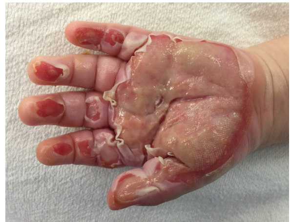
Post-debridement of deep partial-thickness and some full-thickness burns to hand