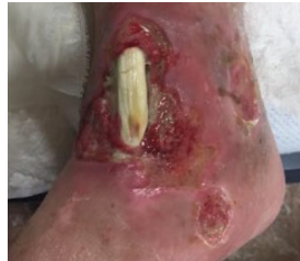
Day 0: Presentation with exposed and desiccated tibialis anterior (TA) tendon