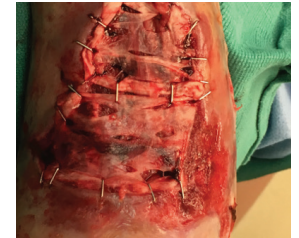
Day 0: Two AMNIOCORD allografts were fenestrated with a 15 blade by surgeon on the back table to expand the surface area coverage and applied to the wound along with negative pressure wound therapy (NPWT)